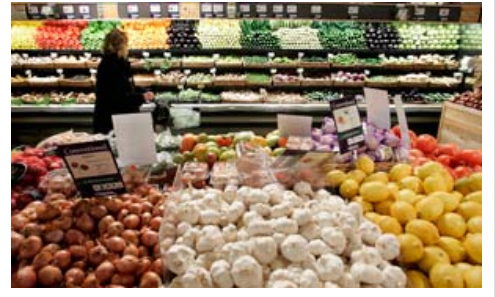
NATURE'S MEDICINE: Careful food selection can improve our health.

While each of us has unique nutritional needs, the following are general guidelines. How each of us responds to specific foods is unique. While a certain food substance in one individual may be curative, in another it may aggravate symptoms or a condition.