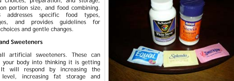
THE HIGH AND LOW: Stevia and artificial sweeteners

Do not drink with meals because this dilutes digestive juices. At most, two or three sips of room